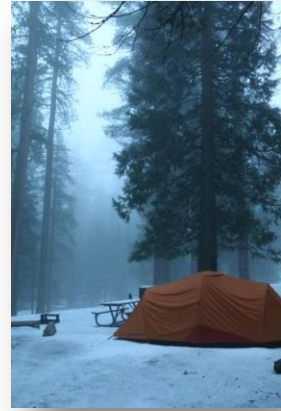
Location: Kings Canyon National Park Lessons: Peace, Confidence, Baggage vs. Luggage