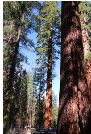
Location: Merced Sequoia Forest Revelation: Majesty, Reverence, His Constant Presence