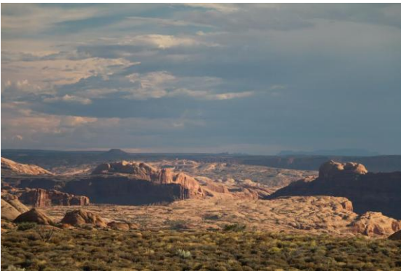
Location: Arches National Park, Moab, Utah Revelation: The Kindness of the Father Intimacy Trust (I love the Wilderness)