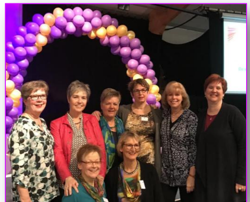
Dutch National Team of Aglow.