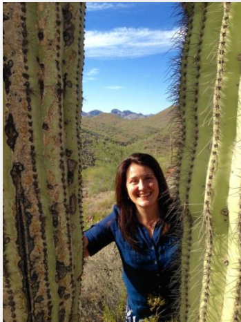
New Life in Arizona!