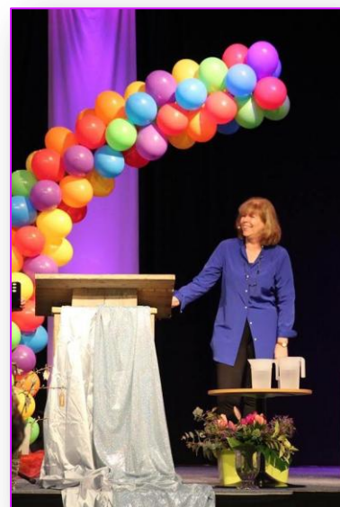
Getting ready to displace some mindsets!

This young husband and father of three had so many questions about the New Man and we had a marvelous discussion before the evening service. He asked to stay in touch as this ground swell in Holland grows, as it seems to be doing.