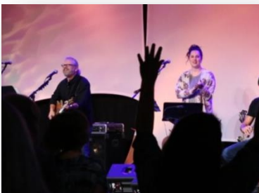
Boob Book just released a CD called Sacred Space Project 1. It's available at: www.bobbookmusic.com