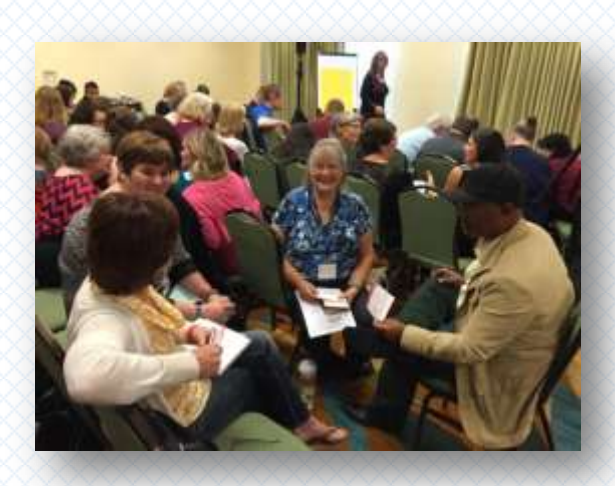
Group Activation 1