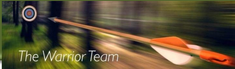
Eric Dykstra Warrior Team Coach

“Warrior Team is a group of warriors, pioneers and explorers who continue to strengthen their training and community through a focused, self-paced training. We climb to new altitudes, acclimate and passionately pursue our growth through all training levels and modules. We are team coached and given opportunities for training and idea exchanges through conversational calls, specialty training, and an increasing variety of media.”