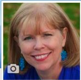
Allison Bown Public Figure