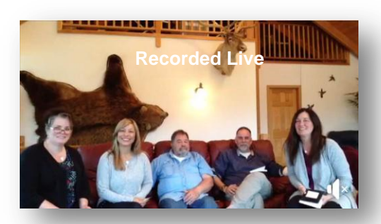
TWC Facebook LIVE from Alaska!