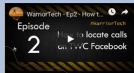
EP 2 - HOW TO LOCATE TWC CALLS ON FACEBOOK