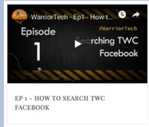
EP 1 - HOW TO SEARCH TWC FACEBOOK

On that note: if you have any questions or video ideas, send an email to twclass.member@gmail.com and place "Warriortech" in the subject line. Your questions will be answered and you may see them featured in a future video!