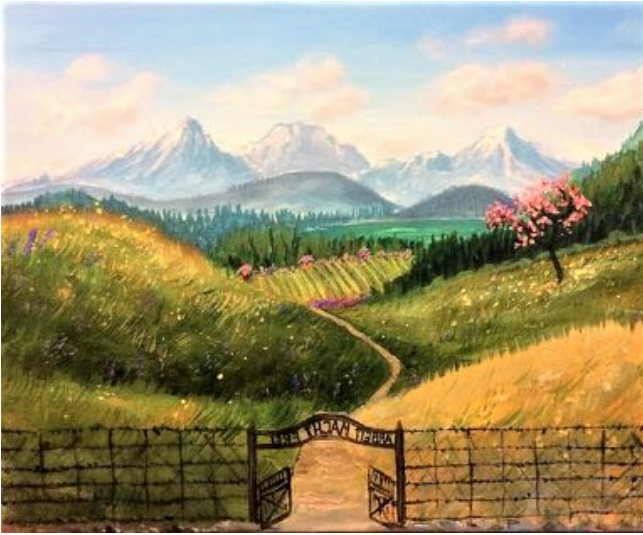
“Setting Captives Free” (from performance-based Christianity) painted by Melody Hewko