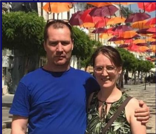
My brother and me