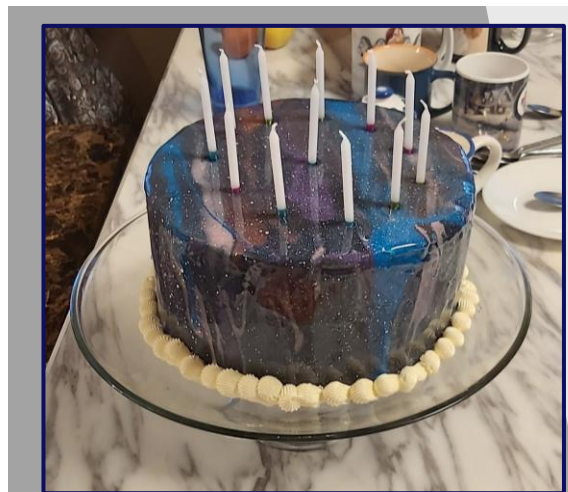
Baking with God...My Passion

Once I finally agreed to this journey, He gave me Proverbs 4:12. The Lord has continued to bring me ideas for recipes and teach me the art of baking and cake decorating. It has been fun to discover the recipes as He brings them to me, and I am learning at the pace He has set for me. Last year I took the next step in this journey and opened a bakery - I don't have a commercial space yet, but that, too, will come in His time.